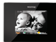
4iE Smart Wifi Thermostat