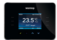
3iE Energy-Monitor Thermostat