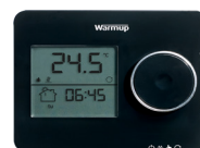
tempo Programmable Thermostat