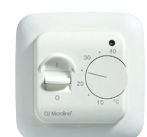
Manual Thermostat MSTAT