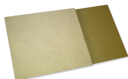
Dual Overlay (WDO)