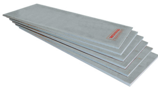
Warmup Insulation Boards