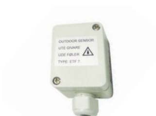
ETF-744/99 Sensor External air sensor