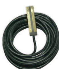
ETOR-55 Sensor Gutter sensor