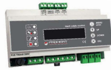
HCC-01 Controller Up to 48 Amps