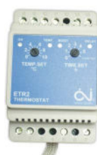
ETR2-1550 Controller Up to 16 Amps