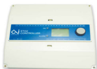
ET02-4550 Controller Up to 48 Amps