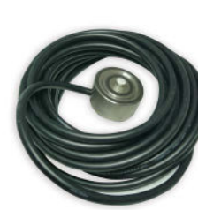
ETOG-55 Sensor Ground sensor